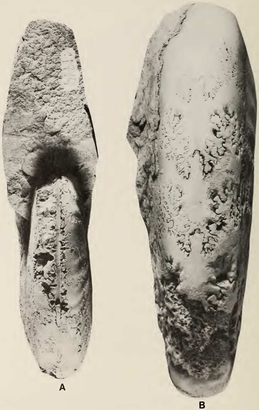
Fig. 3. Haichericeras patagonense Stanton, 1901. A. SAM-PC8454, from Chorrillo Rivero-Río Roble, Argentina. B. OUM KX 1819. All \times 1 .